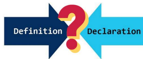
Figure 1: Understanding the power difference between Definition vs. Declaration

It's prudent at this point to touch upon recovery goals and desired outcomes. While everyone is different and free to choose their own path, including their own definition of recovery and what specific goals or outcomes they desire, SAMHSA points to recovery as the primary objective for someone seeking freedom from the shackles of substance use or addiction disorders. Debate continues on whether sobriety, as defined by 12-step programs, is the optimal or only viable form of recovery; note SAMHSA doesn't mention sobriety as an outcome or condition of recovery. Instead, they suggest recovery is a process of change, targeting the 8 dimensions.